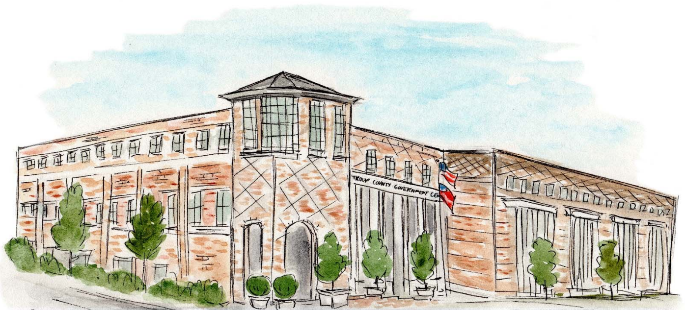
Troup County Government Center La Grange, GA